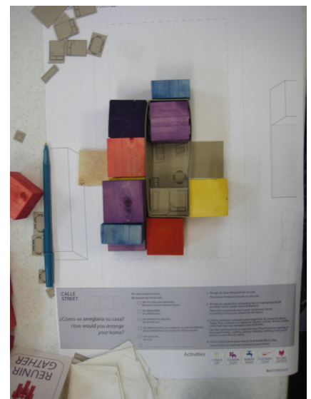
An example of a design activity, conducted with local residents, that informed the design and layout of the Demonstration Project CORE unit.

[D]3.0 Begin post-disaster design process. Establish an implementation plan for the design process depending on the