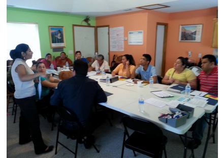
Texas RioGrande Legal Aid educating community residents of home titles and the importance of will in transferring ownership. The meeting was organized and host by LUPE.

Outreach to and inform local social services, faith communities, VOAD groups, and other support organizations about the DRH program. Identify opportunities for collaboration with local groups, such as local groups referring impacted families to the