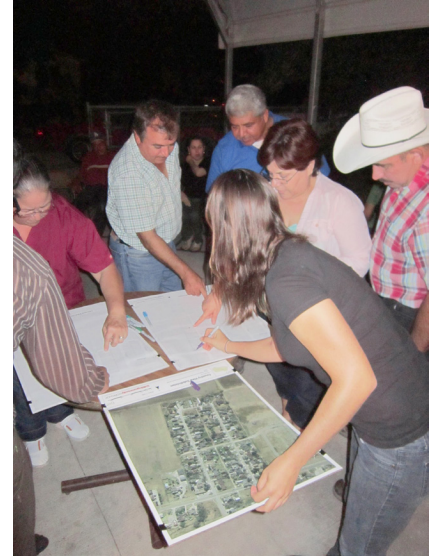
Community meeting with residents of Country View around community priorities and infrastructure needs.

[L]5.1 Use the yearly broad environmental review to assess the local jurisdiction's need for a housing relocation plan. If the broad environmental review identifies areas that are not approved for redevelopment in the event of a disaster, then the local jurisdiction must begin identifying areas and strategies for resident relocation.