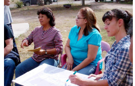
Community meeting with residents of Curry Estates exploring issues of flooding and drainage.