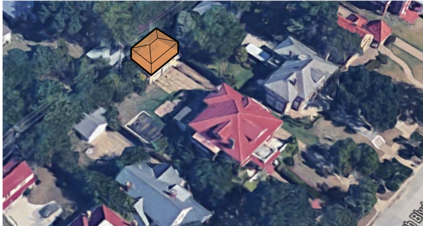
cedar crest neighborhood

Attached ADUs are a part of the main house. They are typically connected along the side or back. ADUs that are separated from the main house but connected by a roof line are often considered attached ADUs.