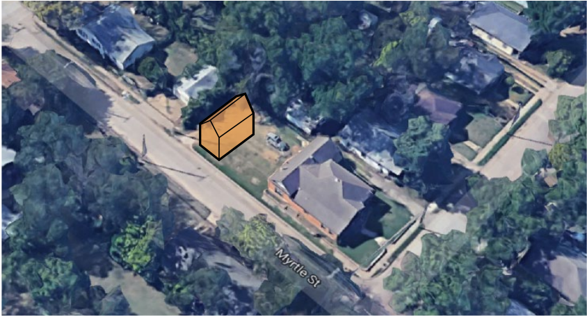
fair park neighborhood

Detached ADUs are separated from the main house, and are considered a separate structure. They can be placed on the lot in a variety of ways, with the access point coming from the street or the alleyway (also know as an alley flat).