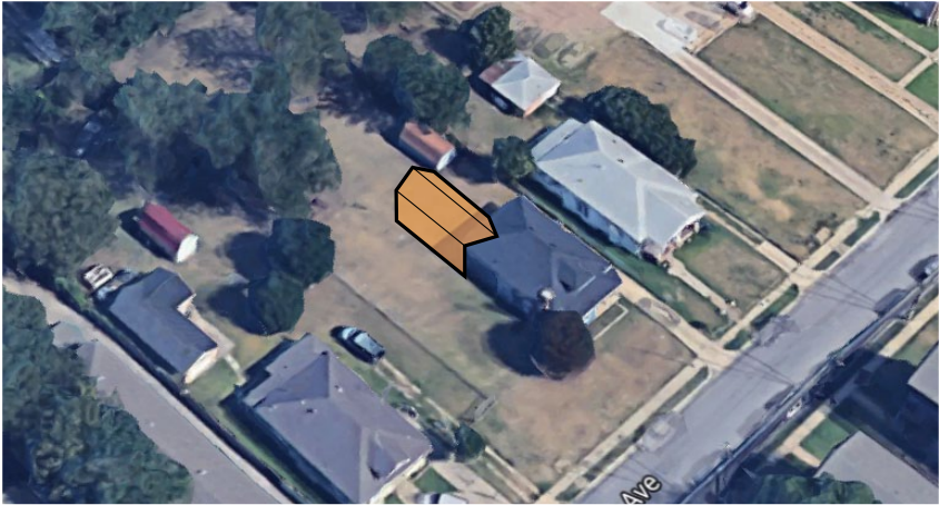
junius heights neighborhood